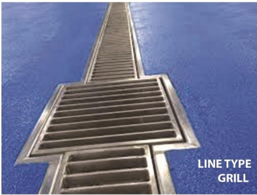
LINE TYPE GRILL