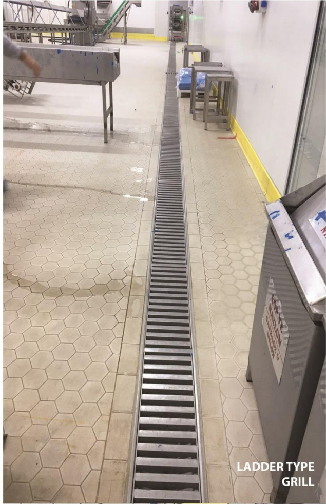
LADDER TYPE GRILL